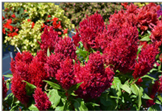
First Flame Red Celosia flowers