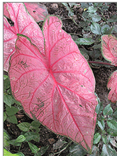
Fannie Munson Caladium foliage

Fannie Munson Caladium is recommended for the following landscape applications;