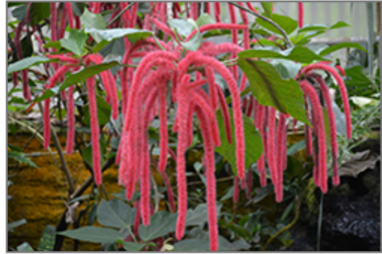
Firetail Chenille Plant flowers