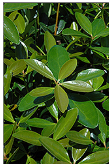
Bigfoot Cleyera foliage