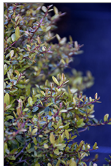
Micron Yaupon Holly foliage