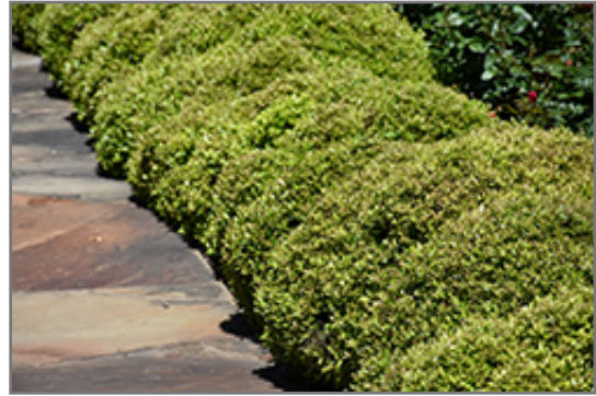
Micron Yaupon Holly

Micron Yaupon Holly will grow to be about 30 inches tall at maturity, with a spread of 3 feet. It tends to fill out right to the ground and therefore doesn't necessarily require facer plants in front. It grows at a slow rate, and under ideal conditions can be expected to live for approximately 15 years.