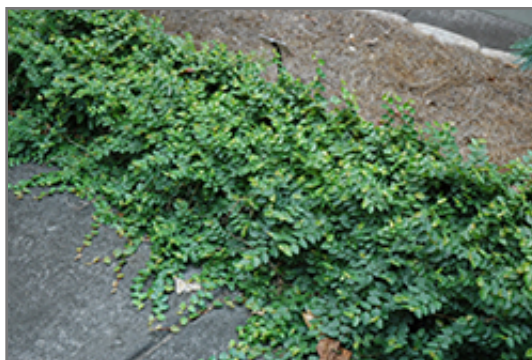
Creeping Fig