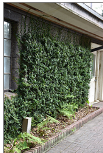
Creeping Fig

Creeping Fig makes a fine choice for the outdoor landscape, but it is also well-suited for use in outdoor containers and hanging baskets. Because of its spreading habit of growth, it is ideally suited for use as a 'spiller' in the 'spiller-thriller-filler' container combination; plant it near the edges where it can spill gracefully over the pot. It is even sizeable enough that it can be grown alone in a suitable container. Note that when grown in a container, it may not perform exactly as indicated on the tag - this is to be expected. Also note that when growing plants in outdoor containers and baskets, they may require more frequent waterings than they would in the yard or garden.