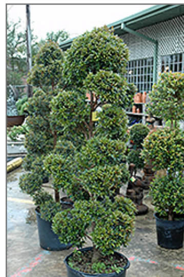
Brush Cherry

Brush Cherry is recommended for the following landscape applications;