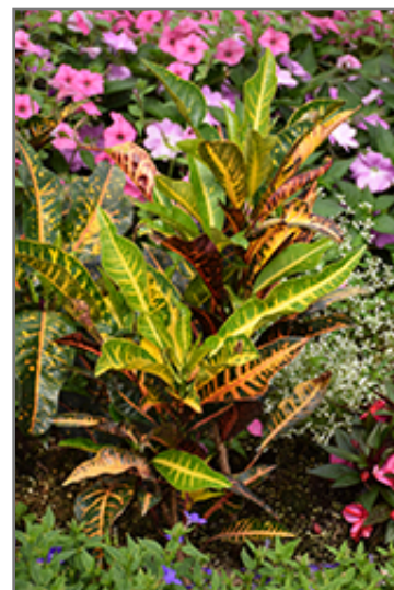
Variegated Croton