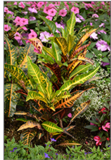
Variegated Croton