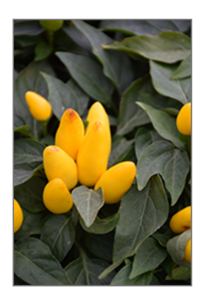
Salsa Yellow Ornamental Pepper fruit

Salsa Yellow Ornamental Pepper is an herbaceous annual with an upright spreading habit of growth. Its medium texture blends into the garden, but can always be balanced by a couple of finer or coarser plants for an effective composition.