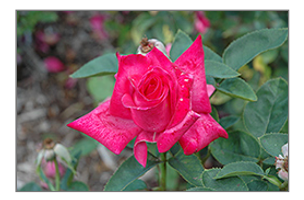
Elizabeth Taylor Rose flowers

2974 Johnston St., Lafayette, LA 70503 (337) 264-1418 buyallseasons.com