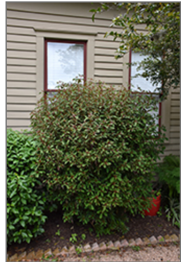
Scarlet Bush

Scarlet Bush makes a fine choice for the outdoor landscape, but it is also well-suited for use in outdoor pots and containers. Because of its height, it is often used as a 'thriller' in the 'spiller-thriller-filler' container combination; plant it near the center of the pot, surrounded by smaller plants and those that spill over the edges. It is even sizeable enough that it can be grown alone in a suitable container. Note that when grown in a container, it may not perform exactly as indicated on the tag - this is to be expected. Also note that when growing plants in outdoor containers and baskets, they may require more frequent waterings than they would in the yard or garden.