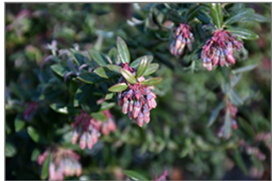
Rosa's Blush Blueberry flowers