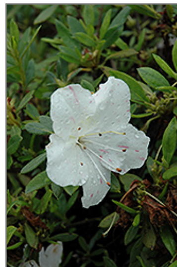
Encore Autumn Starlite Azalea flowers