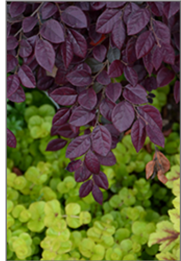
Crimson Fire Chinese Fringeflower foliage

This shrub does best in full sun to partial shade. It prefers to grow in average to moist conditions, and shouldn't be allowed to dry out. It may require supplemental watering during periods of drought or extended heat. It is particular about its soil conditions, with a strong preference for rich, acidic soils. It is somewhat tolerant of urban pollution. Consider applying a thick mulch around the root zone in winter to protect it in exposed locations or colder microclimates. This is a selected variety of a species not originally from North America.