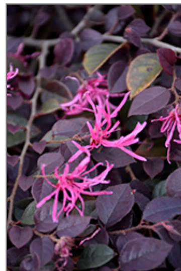
Crimson Fire Chinese Fringeflower flowers

Crimson Fire Chinese Fringeflower is recommended for the following landscape applications;