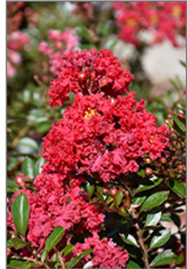
Cherry Dazzle Crapemyrtle flowers

Cherry Dazzle Crapemyrtle is recommended for the following landscape applications;