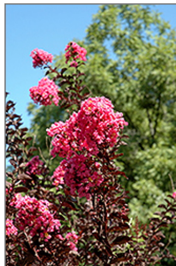
Delta Jazz Crapemyrtle flowers