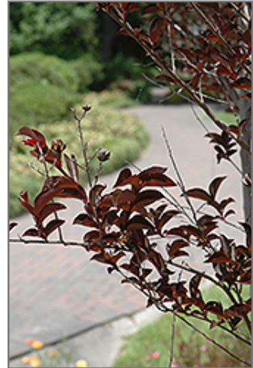
Delta Jazz Crape myrtle foliage

Delta Jazz Crape myrtle makes a fine choice for the outdoor landscape, but it is also well-suited for use in outdoor pots and containers. Its large size and upright habit of growth lend it for use as a solitary accent, or in a composition surrounded by smaller plants around the base and those that spill over the edges. It is even sizeable enough that it can be grown alone in a suitable container. Note that when grown in a container, it may not perform exactly as indicated on the tag - this is to be expected. Also note that when growing plants in outdoor containers and baskets, they may require more frequent waterings than they would in the yard or garden.