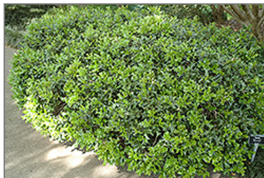
Rotunda Chinese Holly