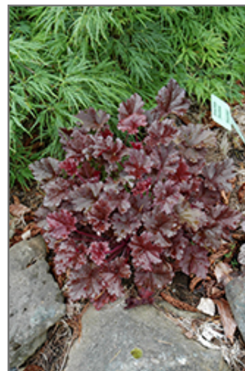
Dark Secret Coral Bells

Dark Secret Coral Bells is recommended for the following landscape applications;