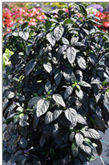
Black Pearl Ornamental Pepper