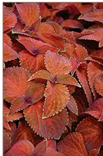
Wizard Sunset Coleus foliage

Wizard Sunset Coleus is recommended for the following landscape applications;