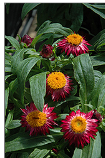
Mohave Dark Red Strawflower flowers