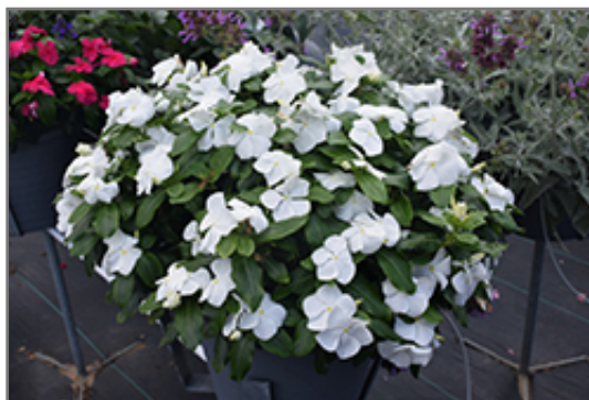
Titan Pure White Vinca in bloom

Titan Pure White Vinca will grow to be about 14 inches tall at maturity, with a spread of 12 inches. Its foliage tends to remain dense right to the ground, not requiring facer plants in front. It grows at a fast rate, and under ideal conditions can be expected to live for approximately 5 years. As an evergreen perennial, this plant will typically keep its form and foliage year-round.