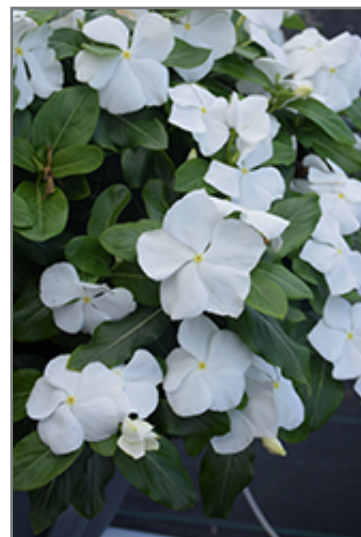
Titan Pure White Vinca flowers

Titan Pure White Vinca is recommended for the following landscape applications;