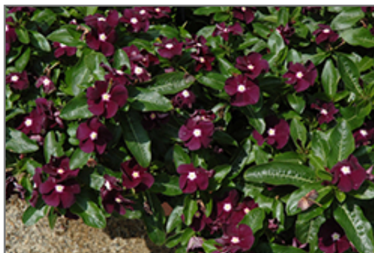
Jams 'N Jellies Blackberry Vinca flowers

Jams 'N Jellies Blackberry Vinca is recommended for the following landscape applications;