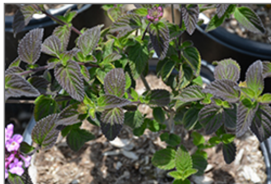
Purple Trailing Lantana foliage