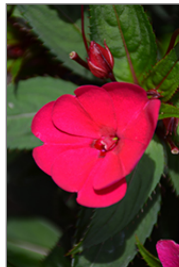
SunPatiens Compact Royal Magenta New Guinea Impatiens flowers

This plant will require occasional maintenance and upkeep, and should not require much pruning, except when necessary, such as to remove dieback. It is a good choice for attracting bees and butterflies to your yard. It has no significant negative characteristics.