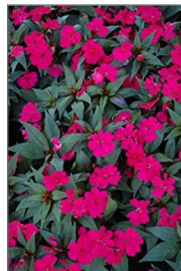
SunPatiens Compact Royal Magenta New Guinea Impatiens flowers