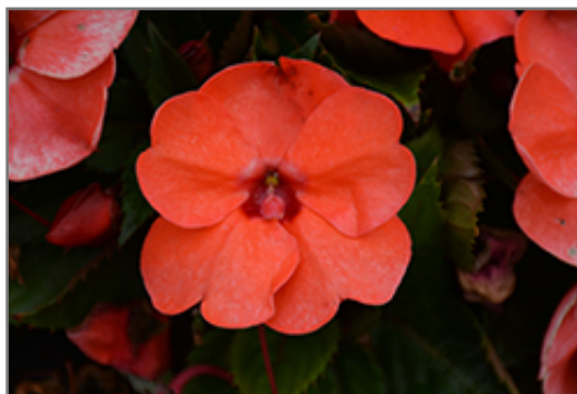
SunPatiens Compact Hot Coral New Guinea Impatiens flowers

This plant will require occasional maintenance and upkeep, and should not require much pruning, except when necessary, such as to remove dieback. It is a good choice for attracting bees and butterflies to your yard. It has no significant negative characteristics.