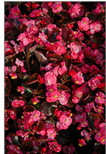
Bada Boom Rose Begonia flowers