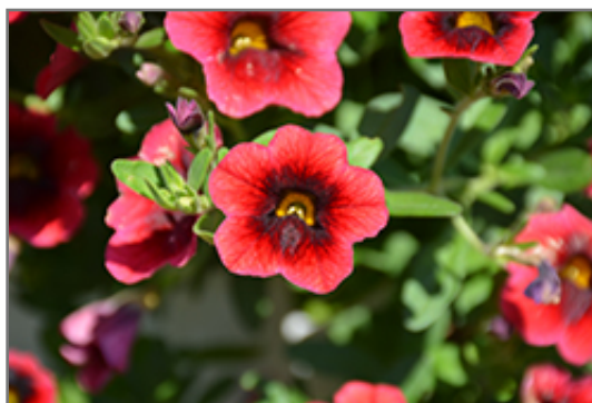
Superbells Pomegranate Punch Calibrachoa flowers