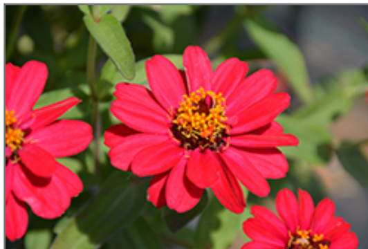
Profusion Double Hot Cherry Zinnia flowers