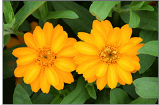
Profusion Double Golden Zinnia flowers