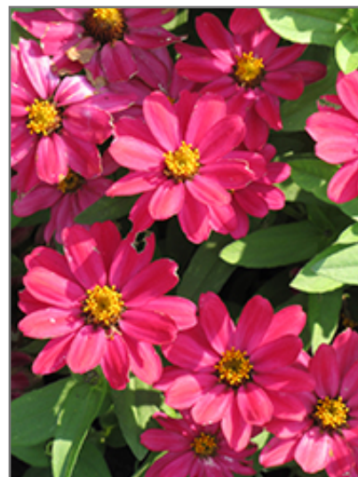
Profusion Cherry Zinnia flowers