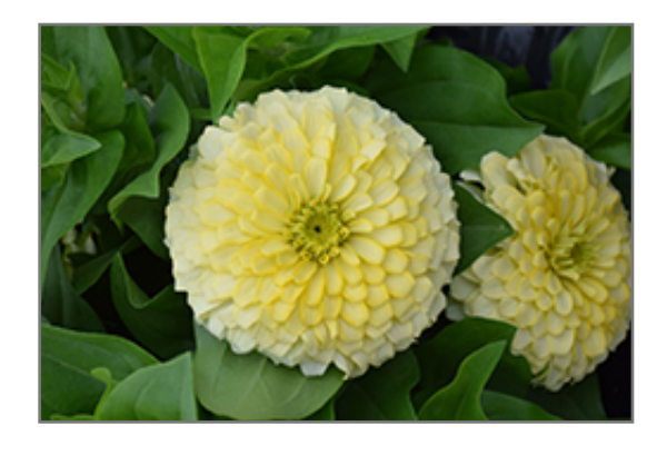
Magellan Ivory Zinnia flowers