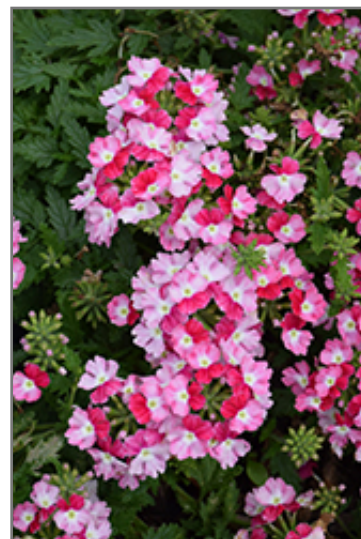
Lanai Twister Red Verbena flowers

Lanai Twister Red Verbena is recommended for the following landscape applications;