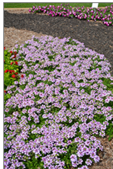
Lanai Twister Purple Verbena in bloom