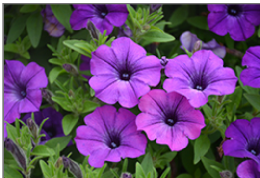
Supertunia Indigo Charm Petunia flowers