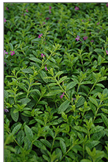
Allyson Mexican Heather foliage