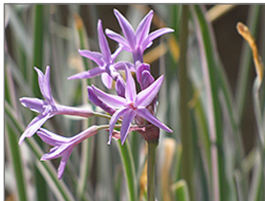
Variegated Society Garlic flowers

Variegated Society Garlic features showy spikes of violet star-shaped flowers with pink overtones rising above the foliage from mid spring to late summer. The flowers are excellent for cutting. Its attractive grassy leaves remain light green in color with prominent white stripes and tinges of silver throughout the season.