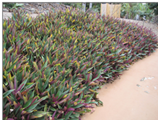
Moses In The Cradle