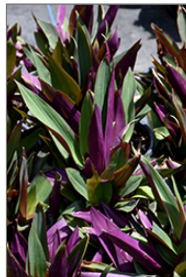
Moses In The Cradle foliage

Moses In The Cradle is recommended for the following landscape applications;