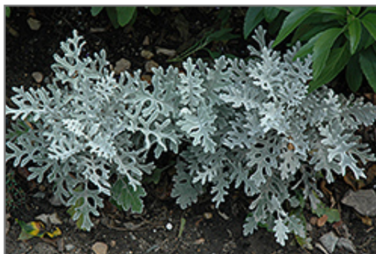
Silver Dust Dusty Miller foliage