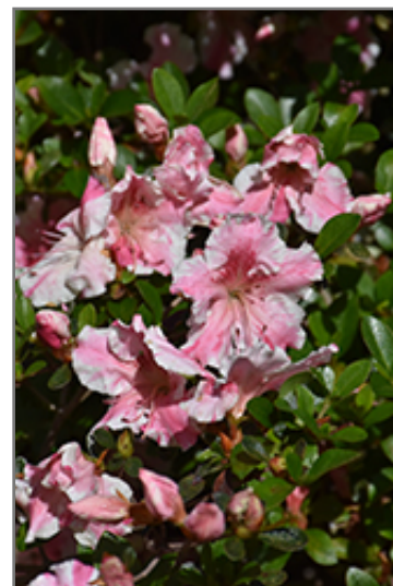
Encore Autumn Sunburst® Azalea flowers