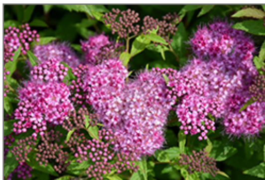
Anthony Waterer Spirea flowers