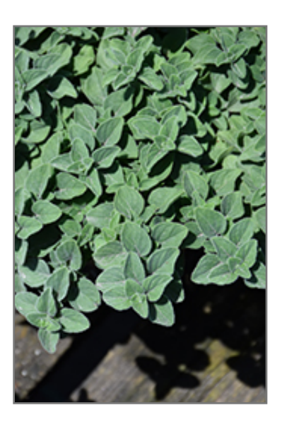
Hot And Spicy Oregano foliage

Aside from its primary use as an edible, Hot And Spicy Oregano is sutiable for the following landscape applications;