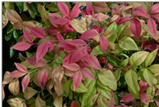
Blush Pink Nandina foliage

Blush Pink Nandina is recommended for the following landscape applications;