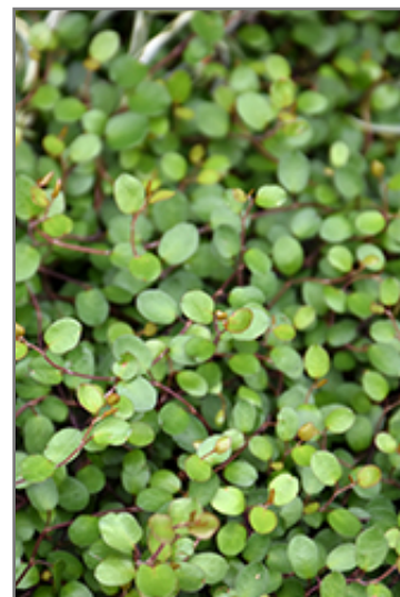
Creeping Wire Vine foliage