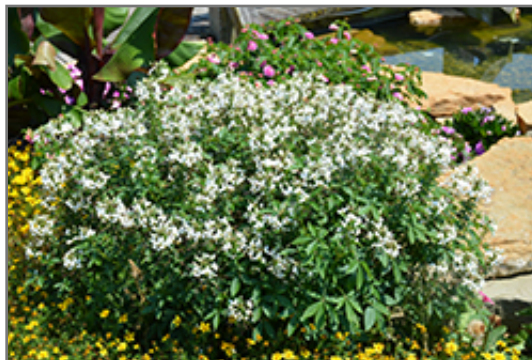
Senorita Blanca Spiderflower in bloom

Senorita Blanca Spiderflower is a fine choice for the garden, but it is also a good selection for planting in outdoor containers and hanging baskets. With its upright habit of growth, it is best suited for use as a 'thriller' in the 'spiller-thriller-filler' container combination; plant it near the center of the pot, surrounded by smaller plants and those that spill over the edges. It is even sizeable enough that it can be grown alone in a suitable container. Note that when growing plants in outdoor containers and baskets, they may require more frequent waterings than they would in the yard or garden.