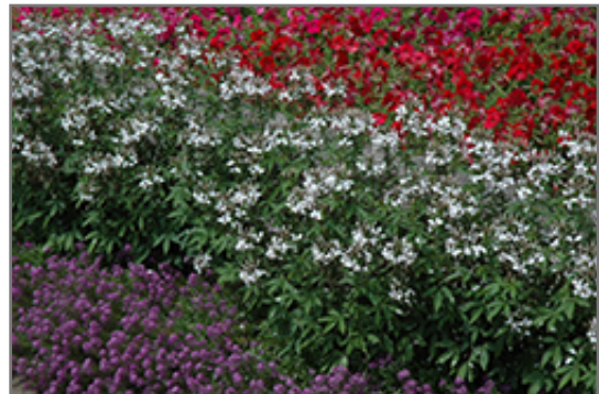
Senorita Blanca Spiderflower in bloom