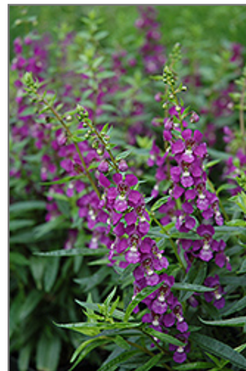
Serenita Purple Angelonia flowers