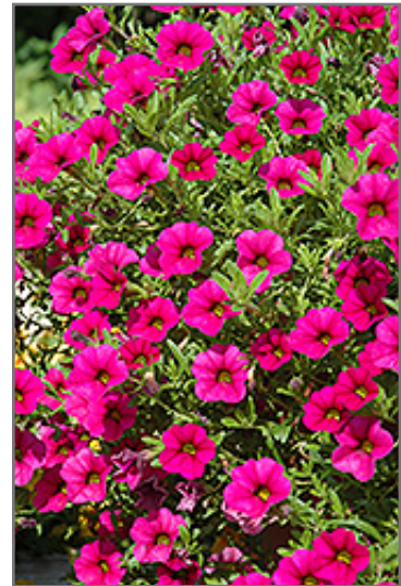
Cabaret Rose Calibrachoa flowers