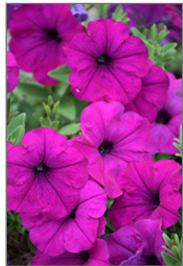
Easy Wave Violet Petunia flowers