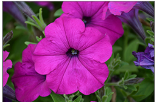
Easy Wave Violet Petunia flowers

This plant will require occasional maintenance and upkeep. Trim off the flower heads after they fade and die to encourage more blooms late into the season. It is a good choice for attracting bees and hummingbirds to your yard, but is not particularly attractive to deer who tend to leave it alone in favor of tastier treats. It has no significant negative characteristics.