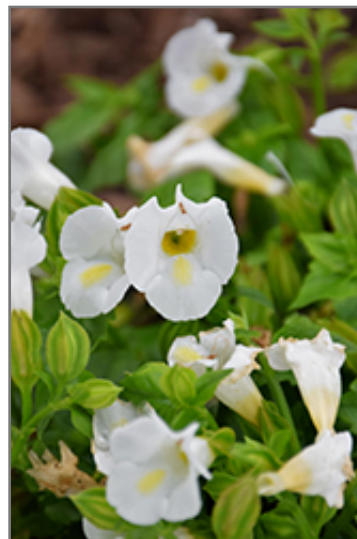
Catalina White Linen Torenia flowers