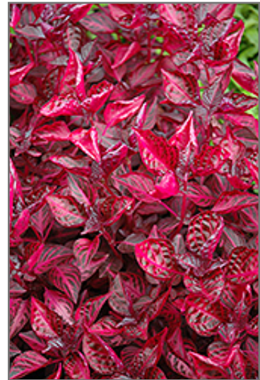
Blood Leaf foliage